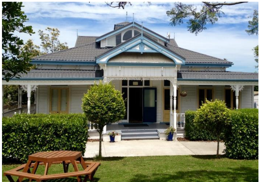
Mt Hobson Middle School (MHMS) opened in 2003. It is a co-educational, boutique, private, middle school.

Most schools are based on a 19th Century model and build innovations on old foundations. The Villa Education model for Years 7-10, was created to suit students learning in the 21st Century and brings an ideal means of teaching and learning to the information age. The school has a maximum roll of 48 students, with 12 to a class. The programme involves all students in fantastic learning experiences and caters for all intelligence traits and learning styles. Academic standards are high and expectations of the students are both demanding and fully supported. Teaching staff are given minimal administrative tasks, as their prime focus is simply to teach.